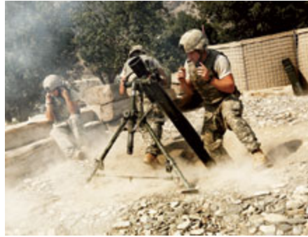
The 120-mm.-mortar squad at the KOP base.