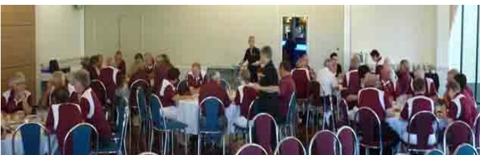
President's Lunch following the 2010 AGM

Following the AGM was the President's Lunch. We all enjoyed lunch subsidised by the chapter and left keen to buy our secret Santa gifts and Christmas celebrations at the Beerwah RSL.