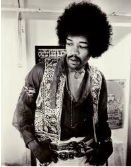
Jimi Hendrix 27 Nov 1942 - 18 Sep 1970

Before he became the legend who was to become a rock icon, Jimi Hendrix was a paratrooper.